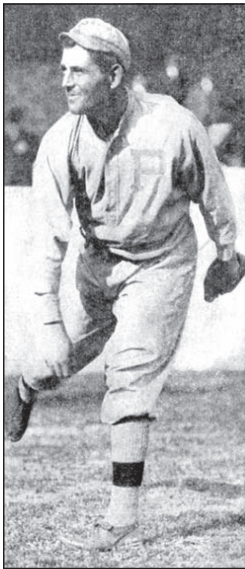
Cactus Cravath, an Outfielder of the Slugging Type

of a problem. Bescher appears a fixture. Long was a very heavy slugger last season though an indifferent fielder. Wilson is slowing up but he is still a beautiful fielder and a good batter.