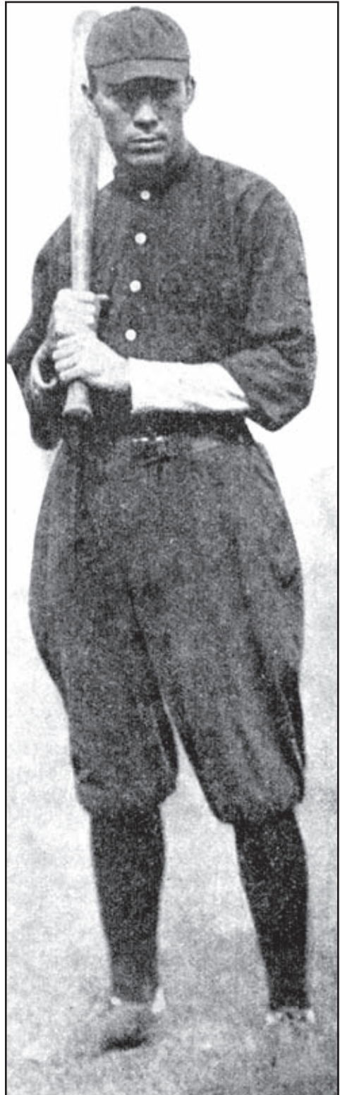
Armando Marsans, the Great Cuban Outfielder, Who Should Prove a Star in 1916